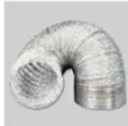
GSA-100 Flexible aluminium ducting.