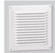
GR-100 Plastic exterior grille.