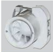
Mounting foot PIE-100/120 Support for wall fixing (accessory)