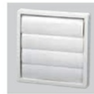
PER-100W Exterior back draft shutter.