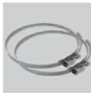
CX-80/125 Worm drive ducting clip.